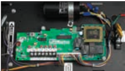
Includes the Medium-Duty Logic Board with Built-In Receiver